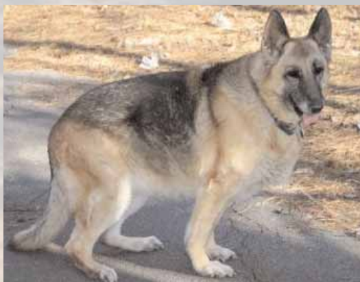
Amherst's Custom Made Lexus May 11, 1990 to September 21, 2004

Lex was the foundation of Jomari Shepherds. I was very blessed to have her in my life for so long. She was not only a beautiful strong bitch, she had a "true" GSD temperament and feared nothing. No doubt, Lexie is up in heaven ruling the roost somewhere!