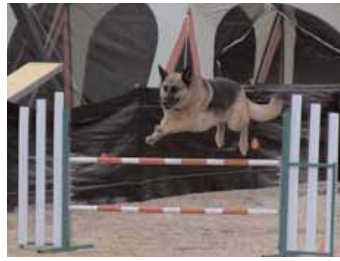
Naya, owned by Ken and Faith Wallace, leaps tall hurdles in a single bound at an agility trial