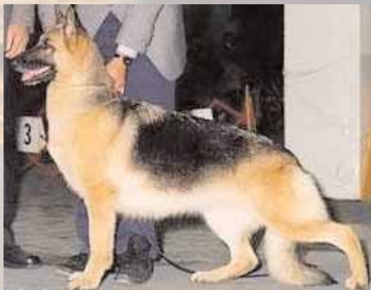
Ch. Jomari's Tequila Sunrise May 12, 1995 to February 18, 2005

Lex was the foundation of Jomari Shepherds. I was very blessed to have her in my life for so long. She was not only a beautiful strong bitch, she had a "true" GSD temperament and feared nothing. No doubt, Lexie is up in heaven ruling the roost somewhere!