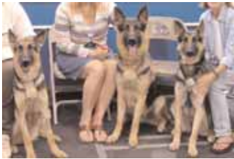
1-1/2 years old—all litter mates out of Ch Kagen's Ringleader & Wayman Way's Harley Davidson Lady, Ziggy and Heidi (L to R)