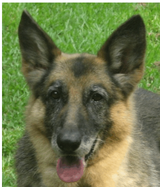
Melana's Obsession v Clihu ROM