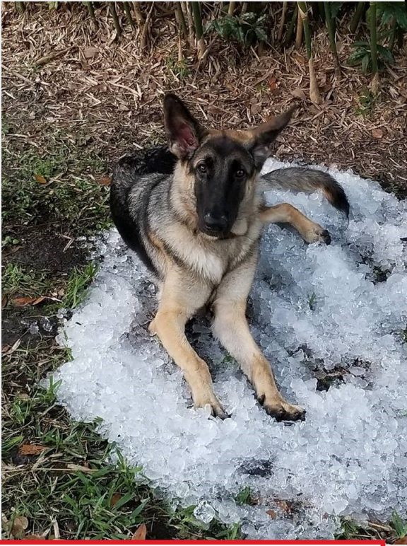
Lady Lily chillin' on ice from Dad's cooler!